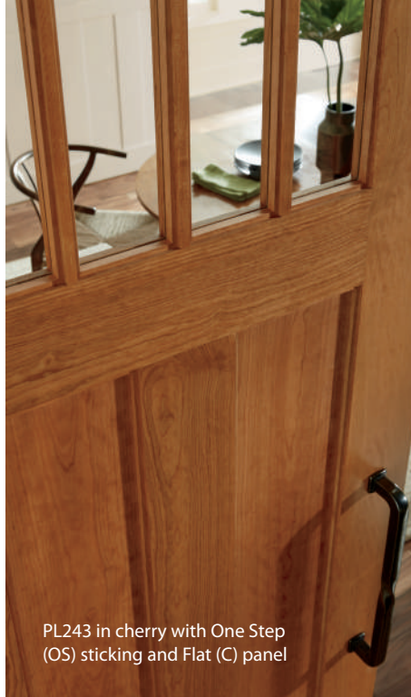
PL243 in cherry with One Step (OS) sticking and Flat (C) panel