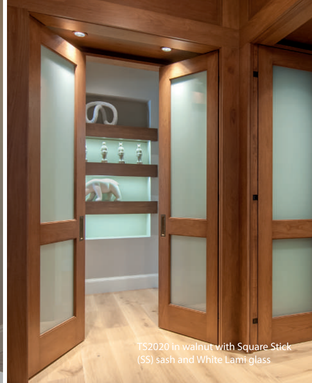
TS2020 in walnut with Square Stick (SS) sash and White Lami glass