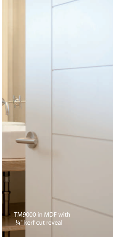
TM9000 in MDF with 1/4" kerf cut reveal