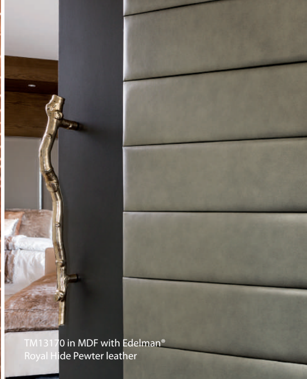
TM13170 in MDF with Edelman® Royal Hide Pewter leather