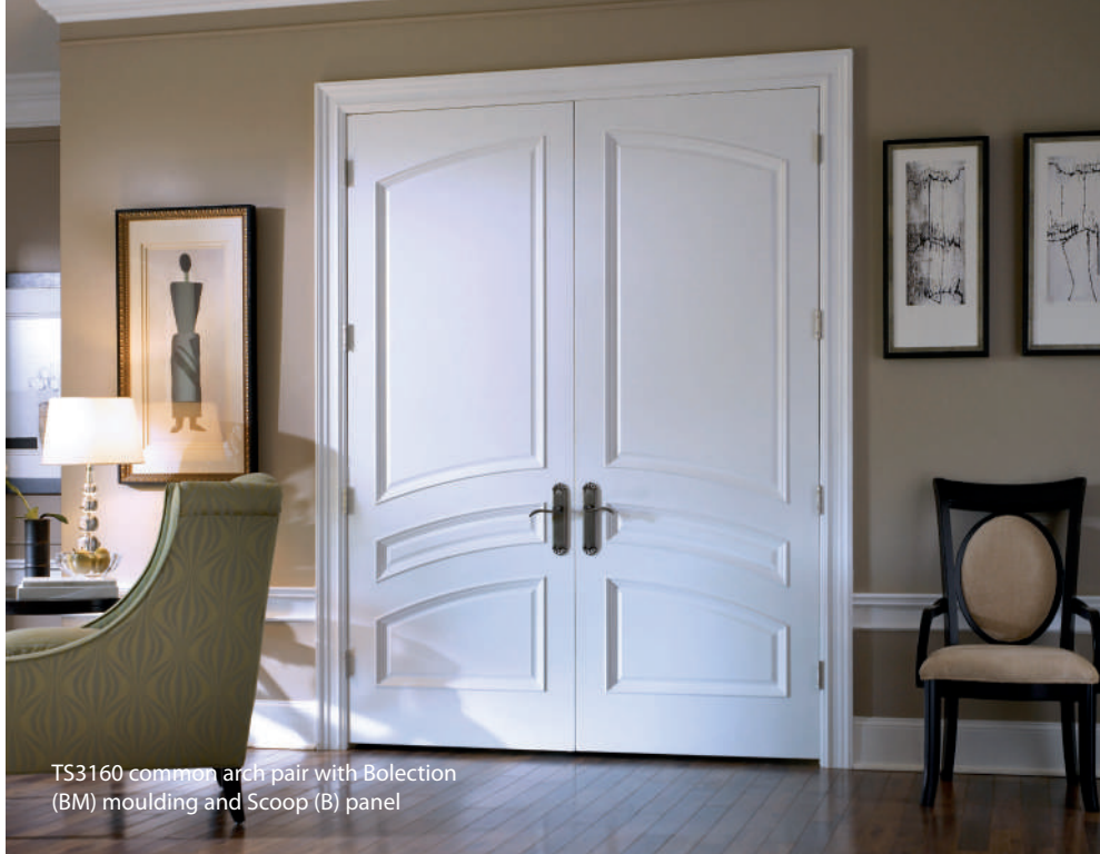
TS3160 common arch pair with Bolection (BM) moulding and Scoop (B) panel

Rather than placing two matching doors side by side, common arch pairs carry details across both doors creating a designed-in look.