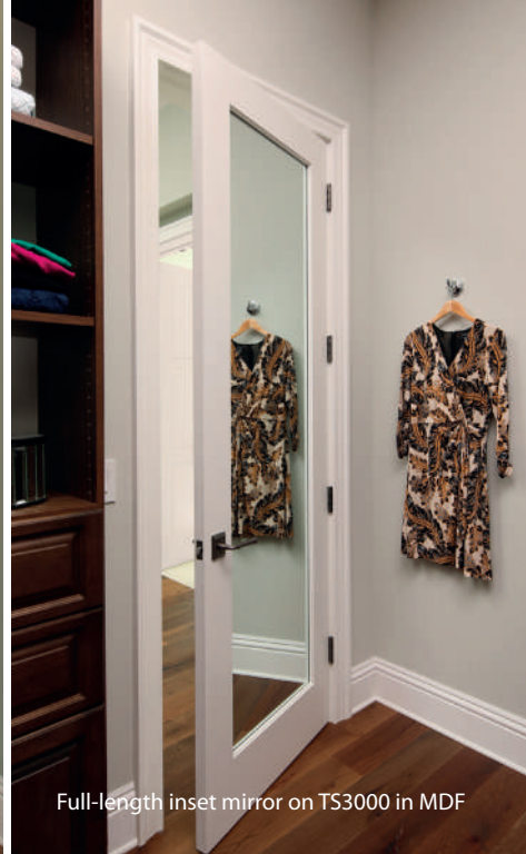
Full-length inset mirror on TS3000 in MDF