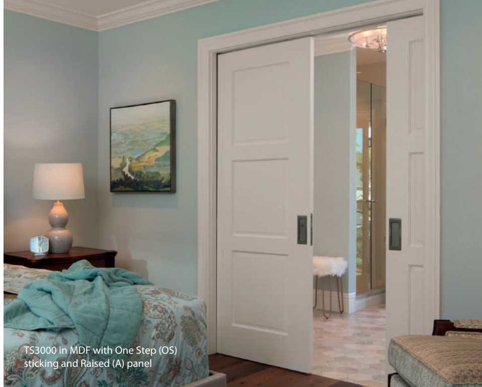
TS3000 in MDF with One Step (OS) sticking and Raised (A) panel

When every opening is designed to fit your exact specifications, we call it a TruStile Design Package. Take advantage of TruStile's flexibility and endless options to create your Design Package today.