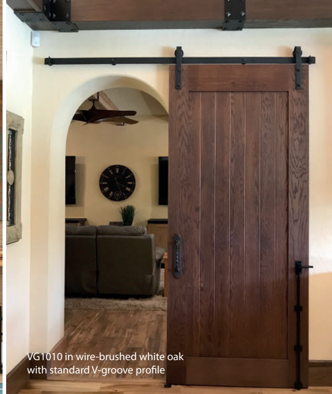
VG1010 in wire-brushed white oak with standard V-groove profile