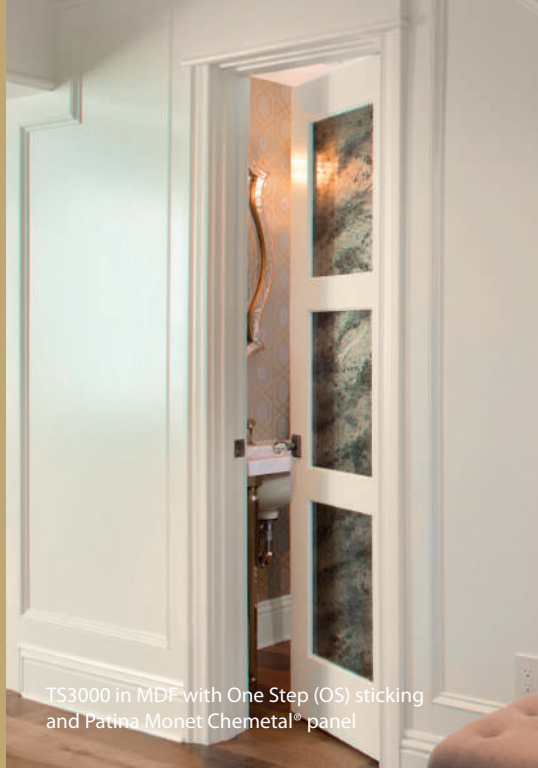
TS3000 in MDF with One Step (OS) sticking and Patina Monet Chemetal® panel