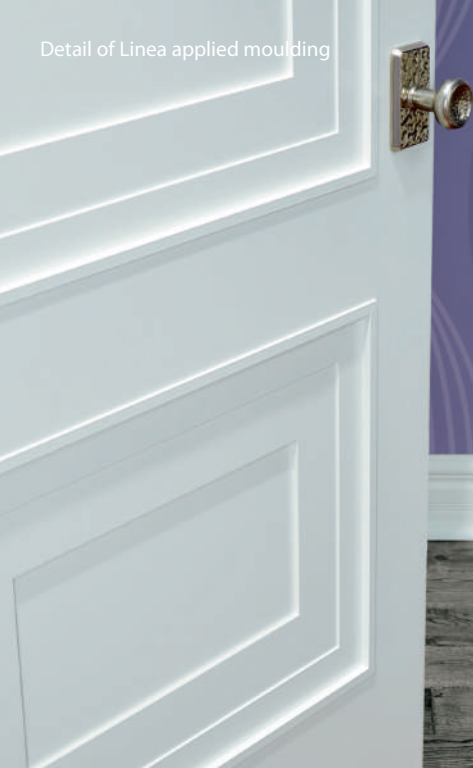
Detail of Linea applied moulding