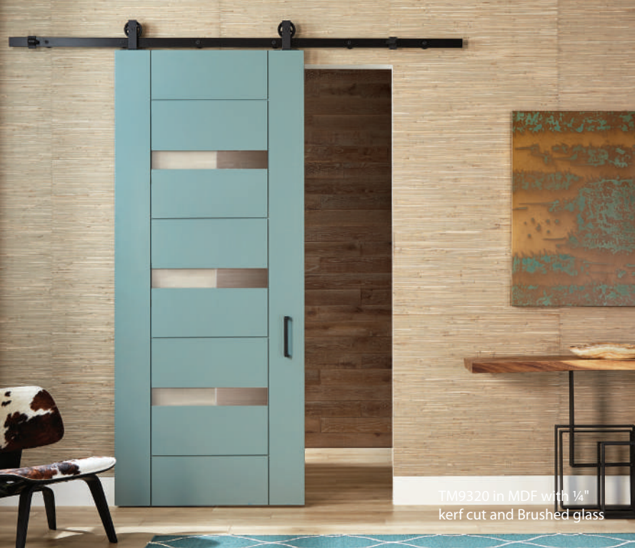
TM9320 in MDF with 1/4" kerf cut and Brushed glass