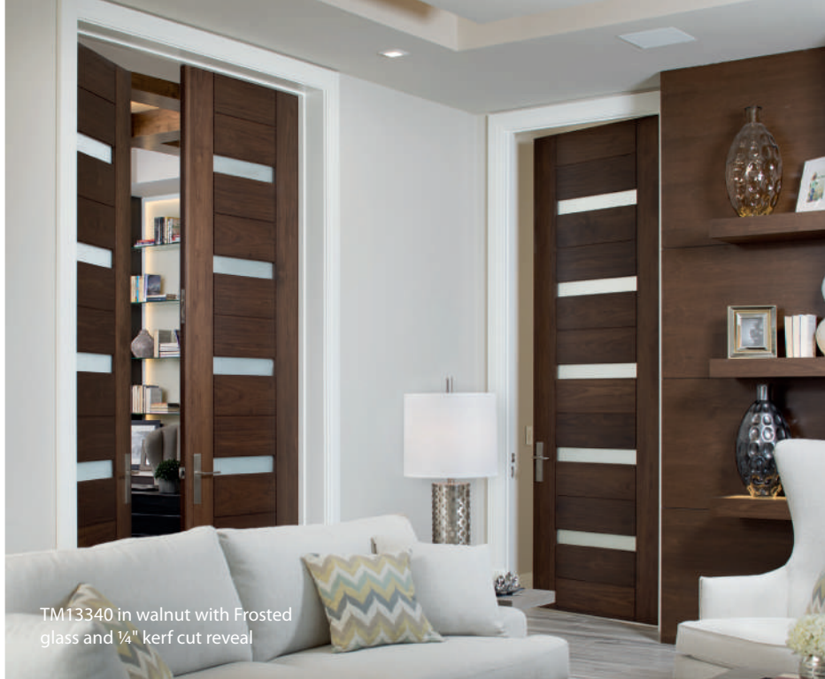
TM13340 in walnut with Frosted glass and 1/4" kerf cut reveal

At TruStile, we believe that every opening is an opportunity to enhance your home's design. Our commitment is to provide today's architects, designers, custom home builders and homeowners with interior doors that support the needs of today's custom projects. Over the next several pages we will walk you through the steps to elevate your next project using interior doors.