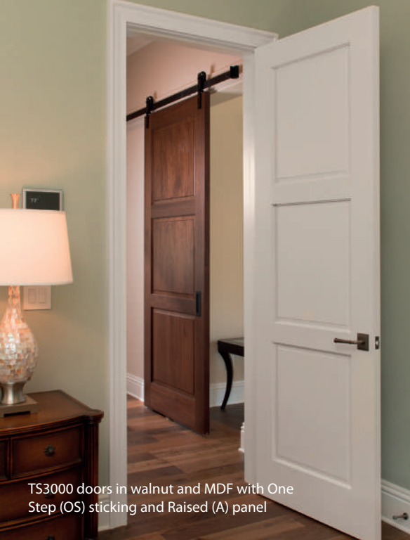
TS3000 doors in walnut and MDF with One Step (OS) sticking and Raised (A) panel