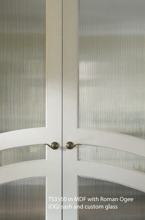
TS3160 in MDF with Roman Ogee (OG) sash and custom glass