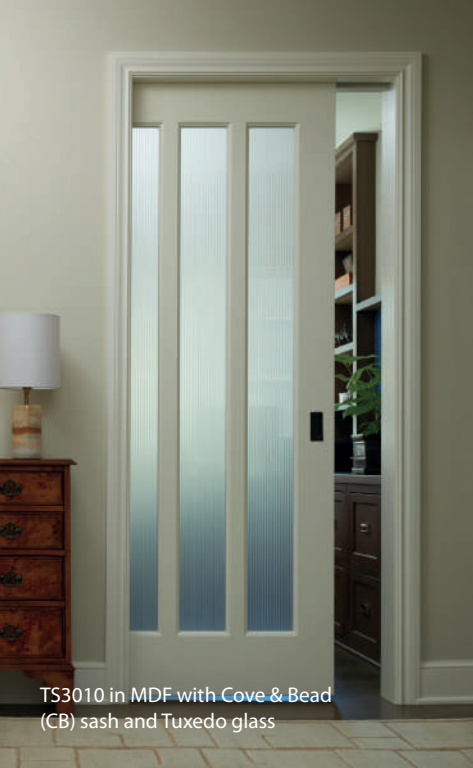
TS3010 in MDF with Cove & Bead (CB) sash and Tuxedo glass