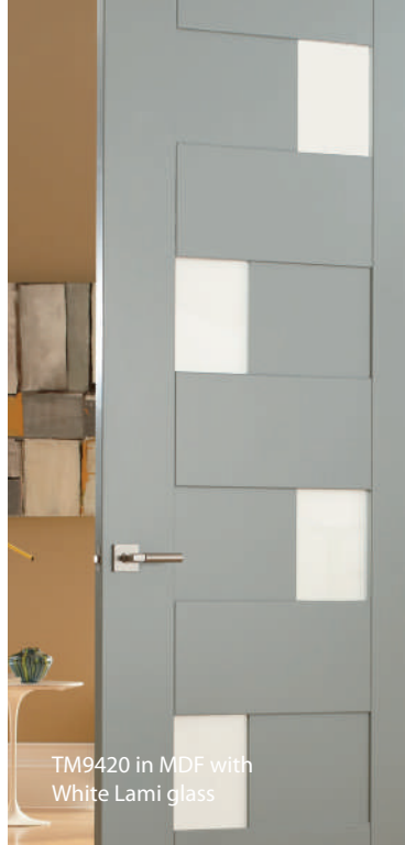
TM9420 in MDF with White Lami glass