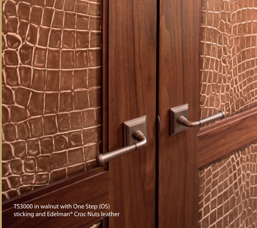
TS3000 in walnut with One Step (OS) sticking and Edelman® Croc Nuts leather