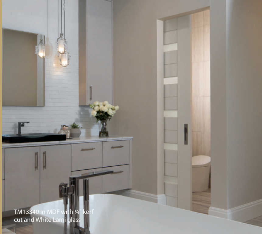
TM13340 in MDF with 1/4" kerf cut and White Lami glass