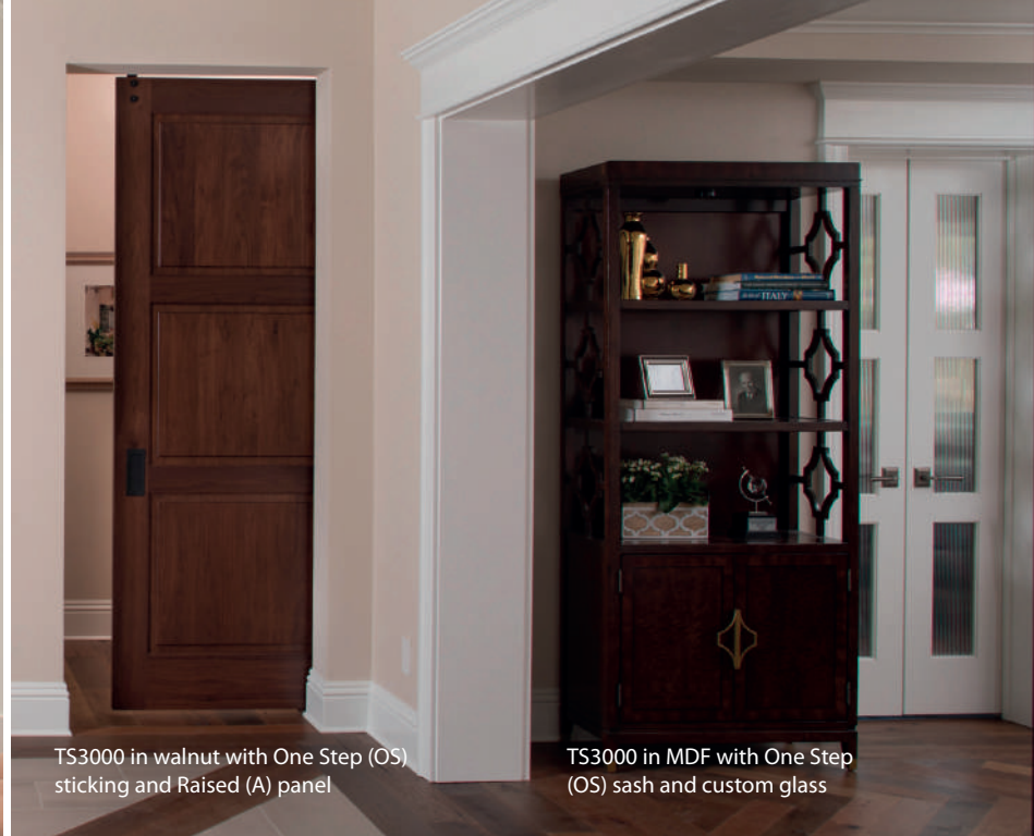
TS3000 in walnut with One Step (OS) sticking and Raised (A) panel