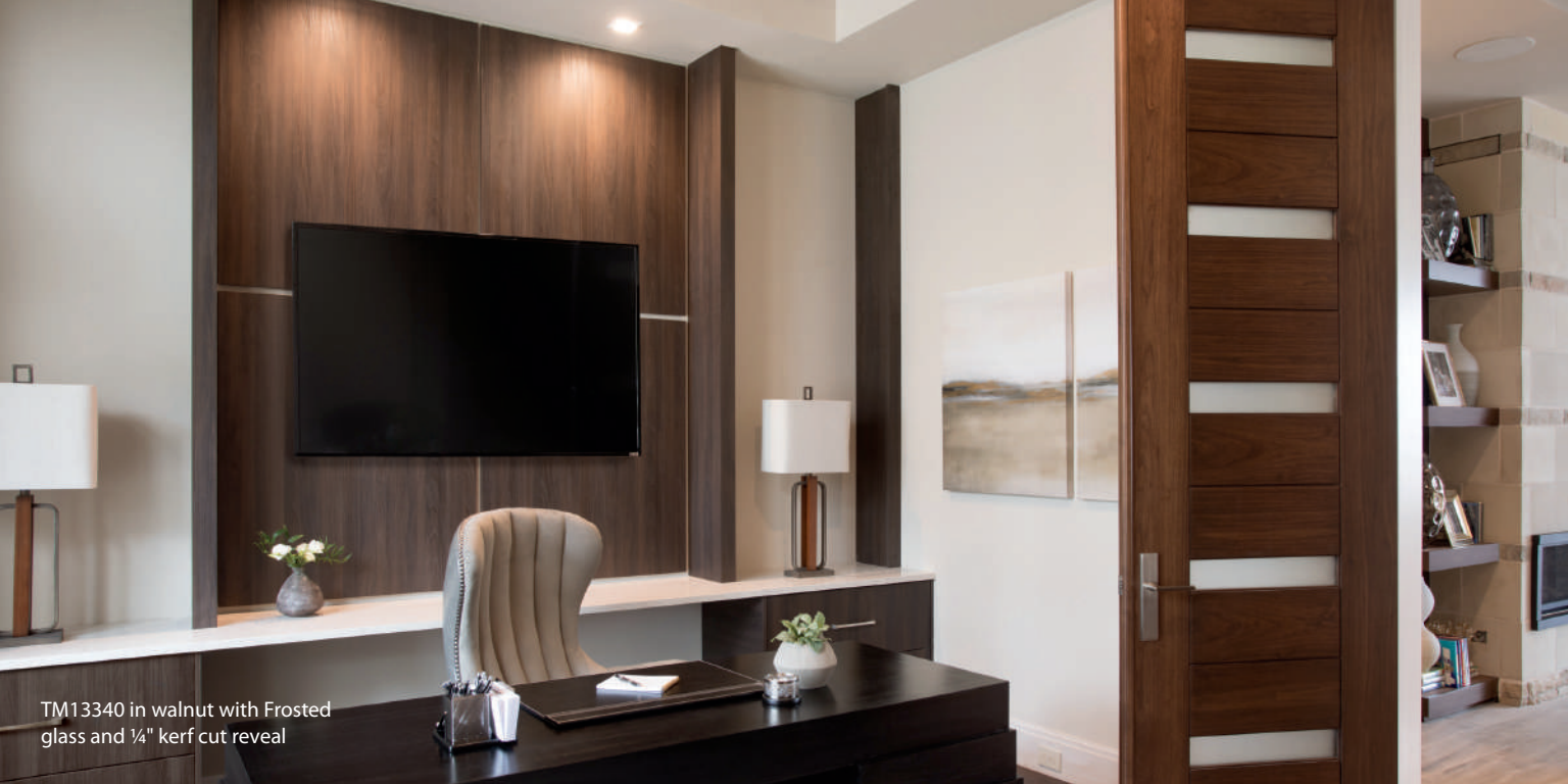
TM13340 in walnut with Frosted glass and ¼" kerf cut reveal