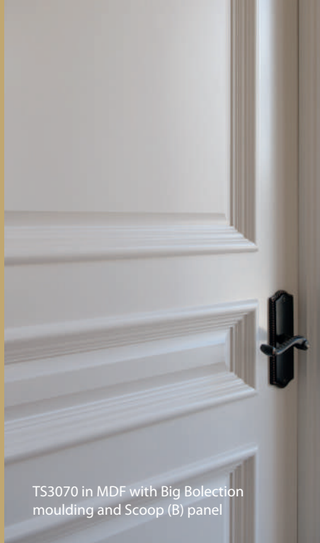
TS3070 in MDF with Big Bolection moulding and Scoop (B) panel