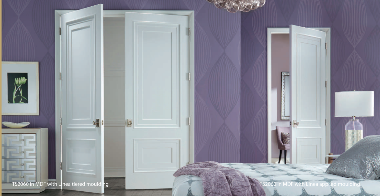
TS2060 in MDF with Linea tiered moulding