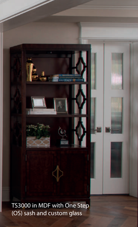
TS3000 in MDF with One Step (OS) sash and custom glass