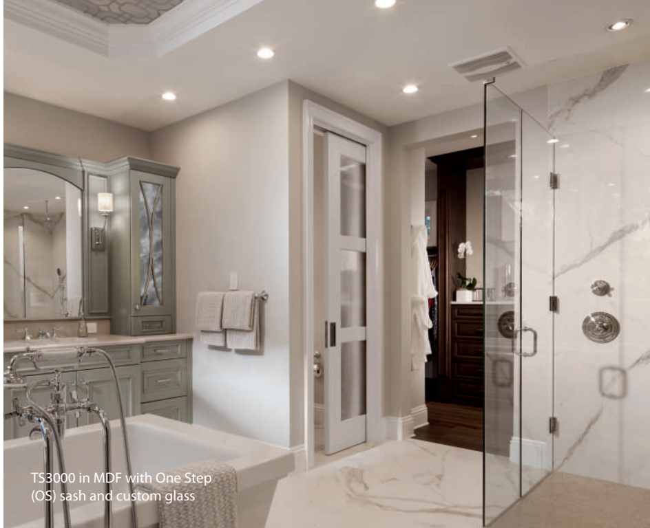
TS3000 in MDF with One Step (OS) sash and custom glass