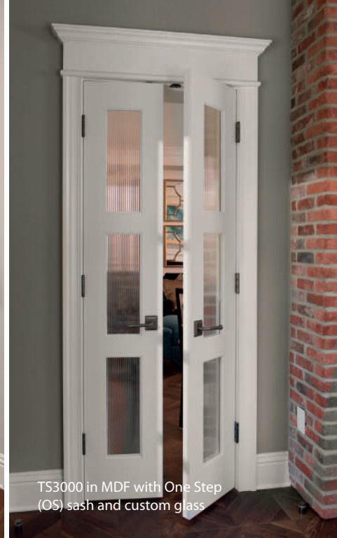
TS3000 in MDF with One Step (OS) sash and custom glass