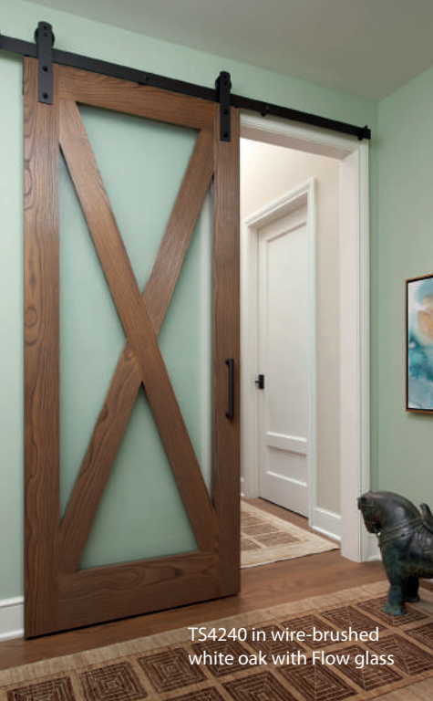
TS4240 in wire-brushed white oak with Flow glass