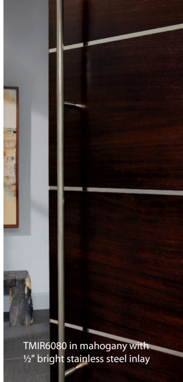
TMIR6080 in mahogany with 1/2" bright stainless steel inlay