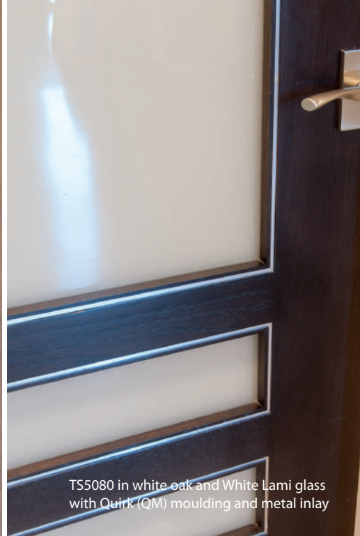
TS5080 in white oak and White Lami glass with Quirk (QM) moulding and metal inlay