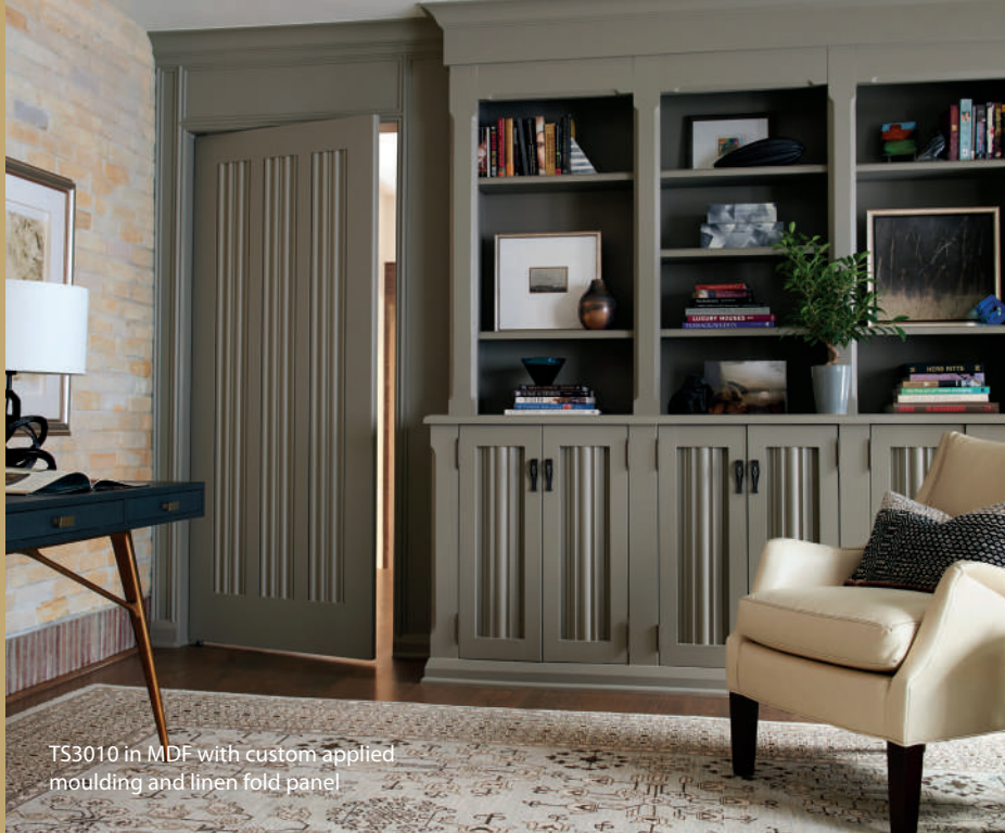
TS3010 in MDF with custom applied moulding and linen fold panel