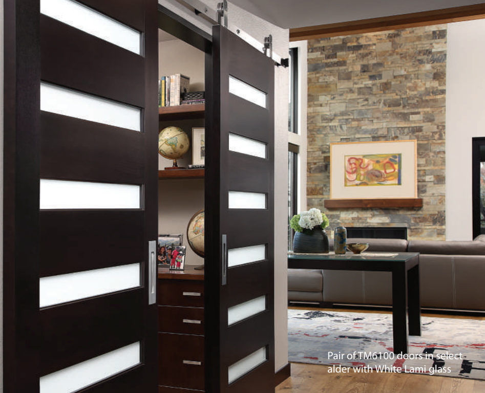
Pair of TM6100 doors in select alder with White Lami glass