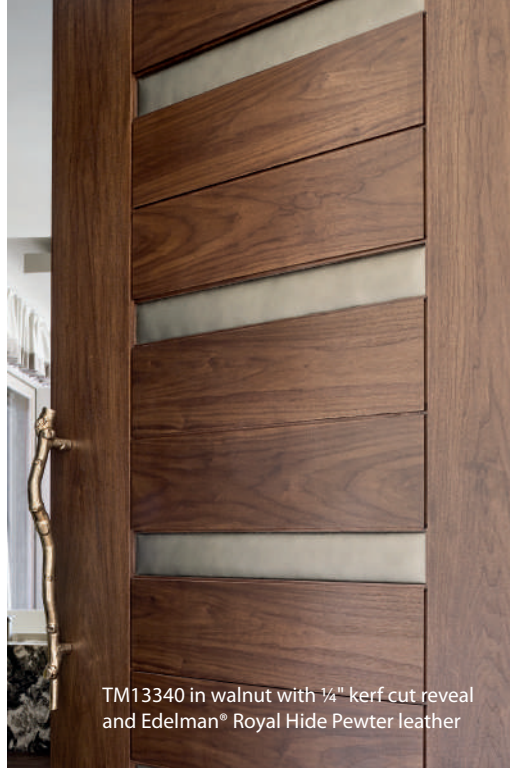
TM13340 in walnut with 1/4" kerf cut reveal and Edelman® Royal Hide Pewter leather